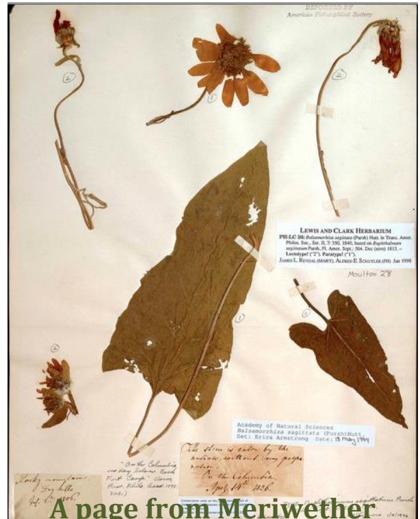
A page from Meriwether Lewis's botanical notebook 1806